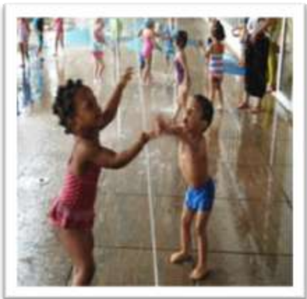
Below: Early Year students enjoying water sports