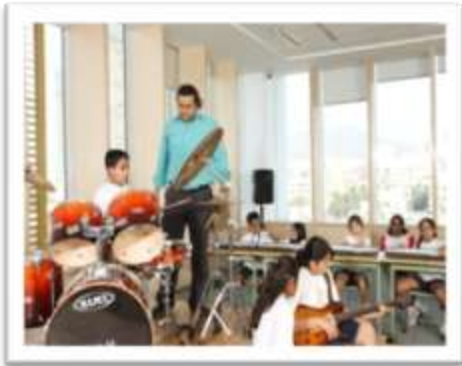
Above: Music & recording room