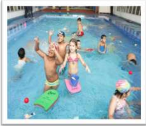
Primary School swimming pool