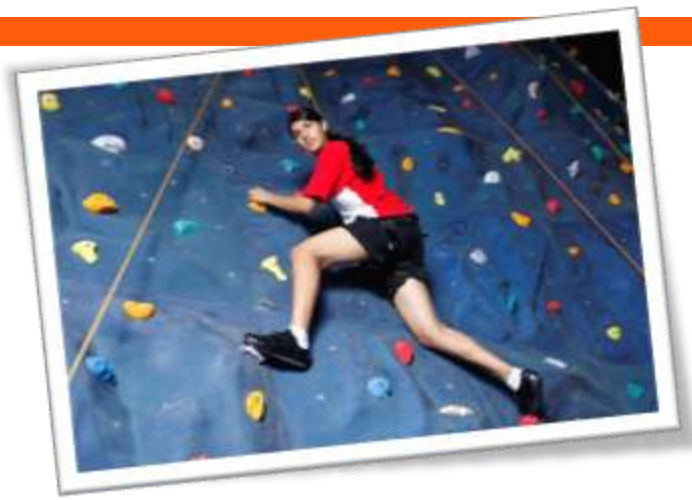
Indoor Rock Climbing & Traverse Wall